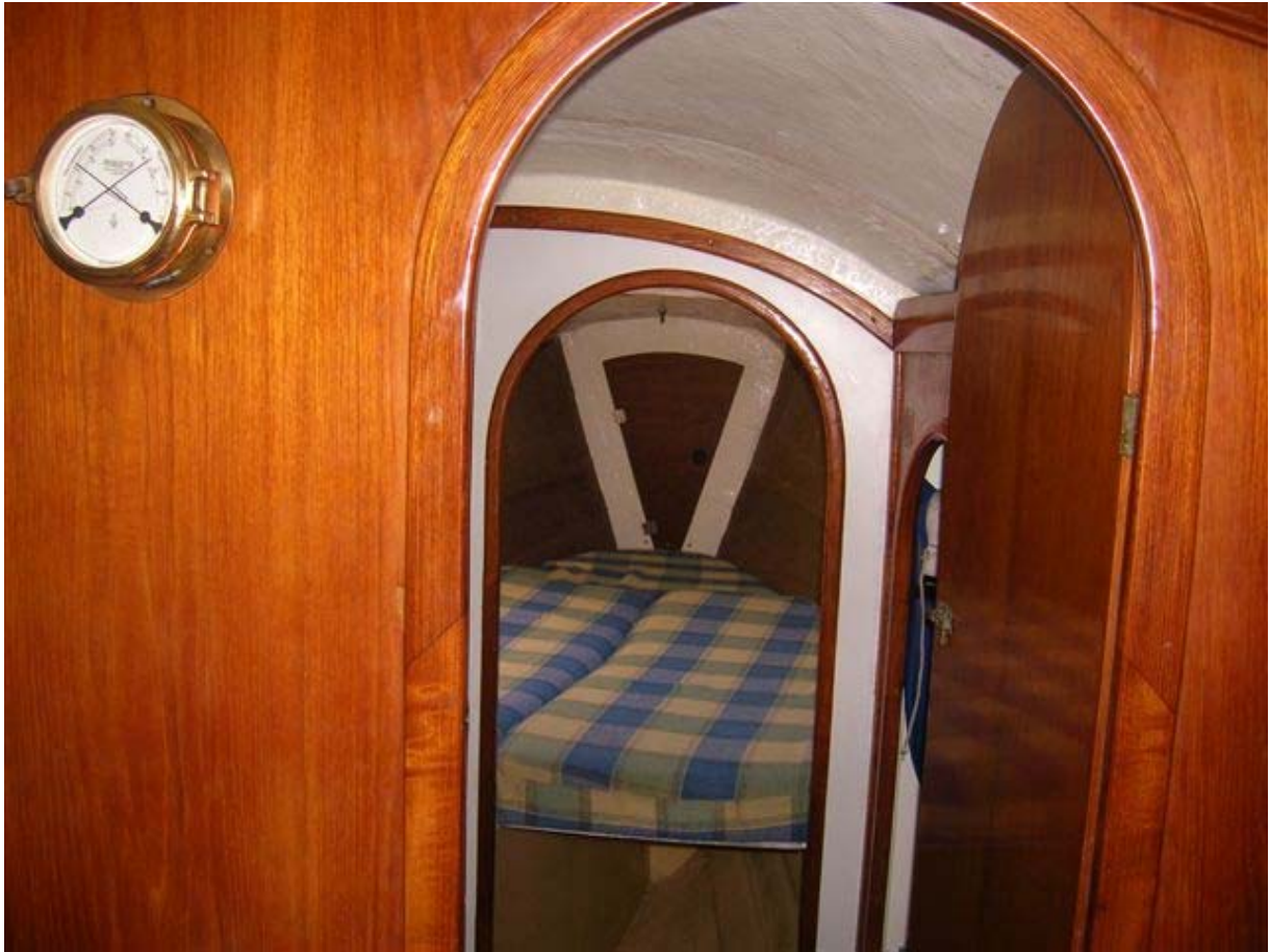
Roomy and private forward cabin