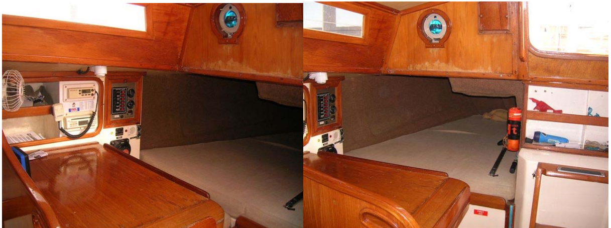
Large workable chart table with chart storage under – Big quarter berth behind.